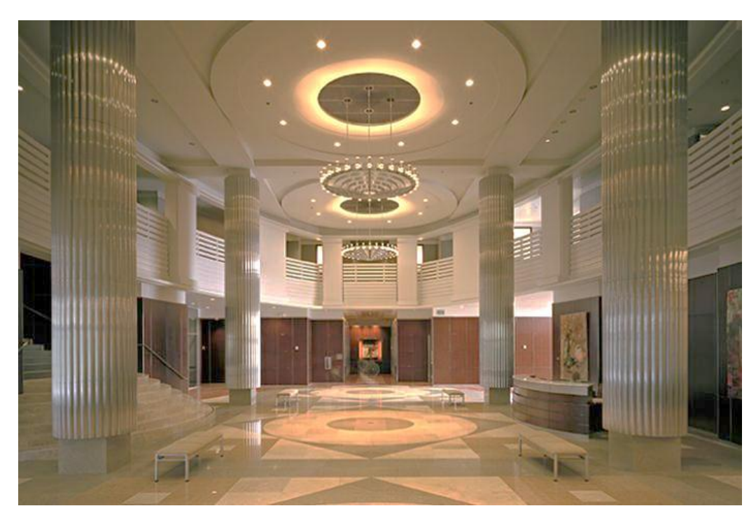
Lobby of Solano County Administration Center

Registrar of Voters County Administration Center 675 Texas Street, Suite 2600 Fairfield, CA 94533 (707) 784-6675 www.solanocounty.com/elections