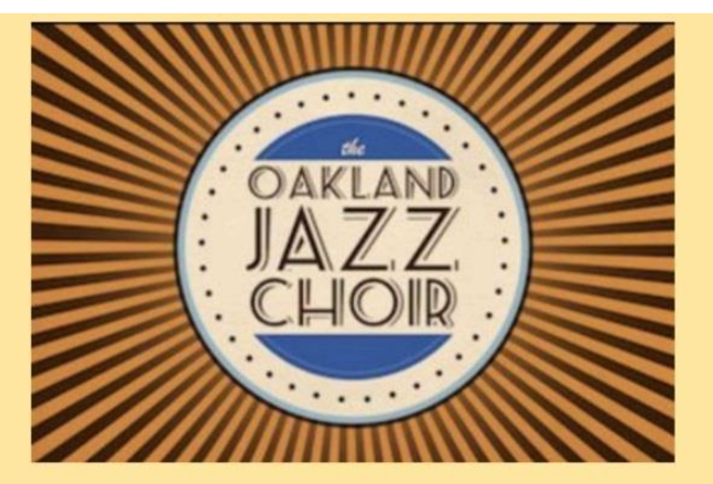
April 14 | 3PM

Music at the Chapel Presents: The Oakland Jazz Choir