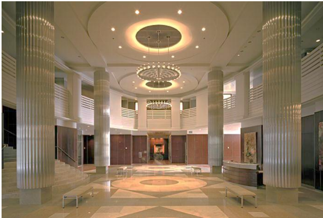
Lobby of Solano County Administration Center

Registrar of Voters County Administration Center 675 Texas Street, Suite 2600 Fairfield, CA 94533 (707) 784-6675 www.solanocounty.com/elections