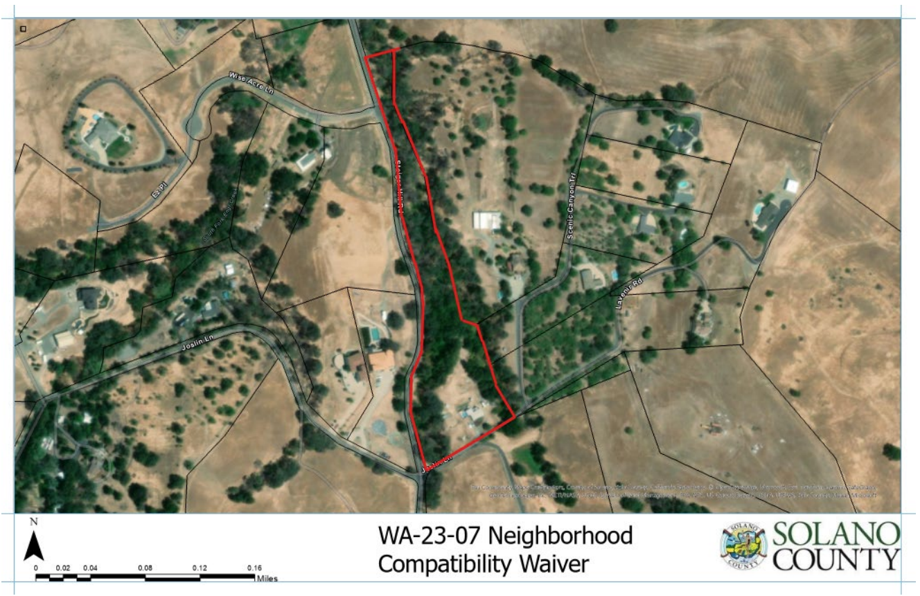
Figure 1 - Vicinity Map of 3967 Joslin Lane

The subject site, located in the Rural Residential zoning district, encompasses approximately 4.5 acres and is located 1-mile northwest of the city of Vacaville in unincorporated Solano County addressed at 3967 Joslin Lane. There is a primary dwelling approximately 73 ft from the access entrance north of Joslin Lane. There are other accessory structures on the property including a private stable and two storage sheds. The parcel is surrounded by lots zoned Rural Residential or Exclusive Agriculture with land uses determined to be residential. The site's topography is flat and bordered by trees to the north, east and west. Figure 1 below is a vicinity map indicating the subject site's location.