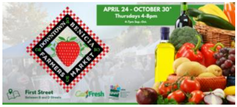
The Benicia Certified Farmers Market will return for its 33rd Season on April 24