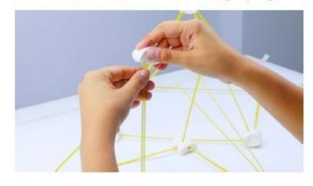
How good a builder are you?

Test your building skills by creating a structure out of marshmallows and dry spaghetti!