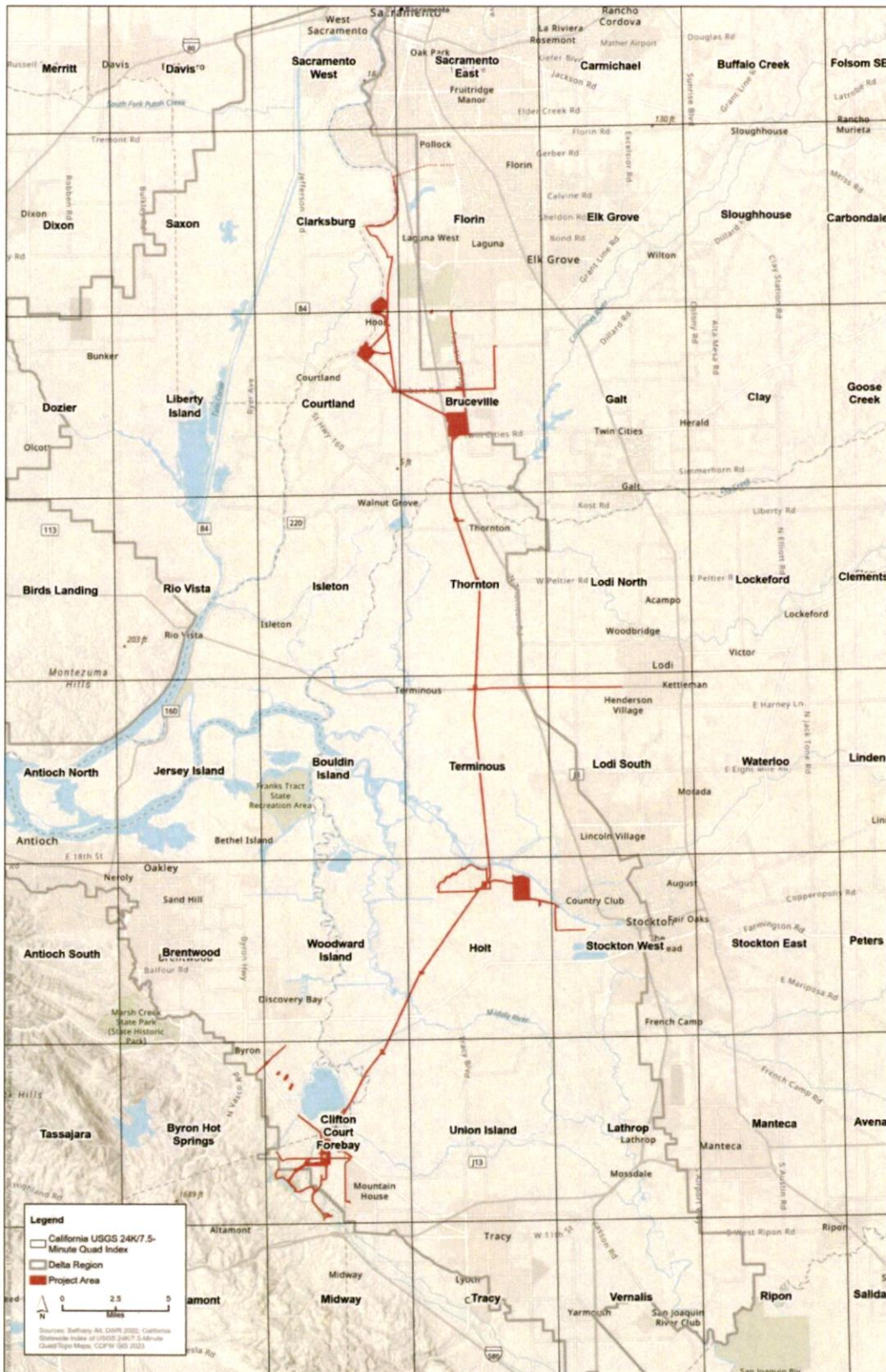
Figure 1. Project Location

California Department of Water Resources