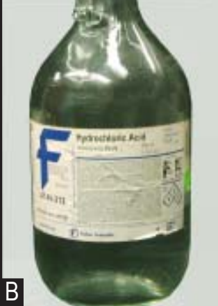
Figure 1: Anhydrous hydrogen chloride gas is stored as a liquid in pressurized containers [A] . Aqueous solutions of hydrogen chloride are called hydrochloric acid or muriatic acid [B] and are found in commercial chemical or swimming pool supply houses.